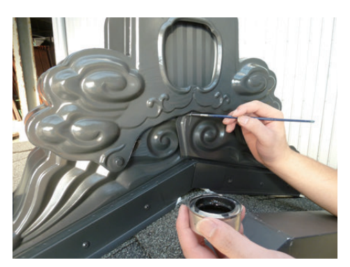
13. Paint any scratches from setting B-12 with the touch-up paint.