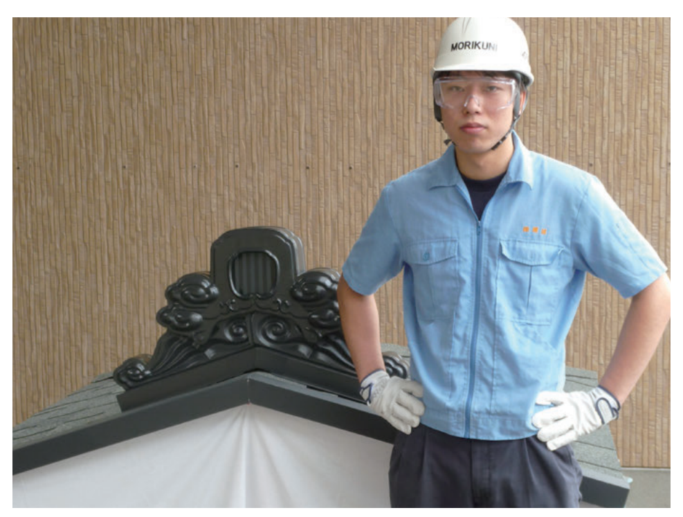
FINISH Please wear a helmet, goggles, gloves and safety belt to work safely and efficiently at high working site.