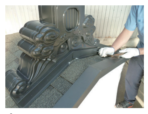
9. Make 6 guide holes on the front side and another 6 guide holes on the back side of B-12. Those are for 1in.-screws to pierce through the wood.