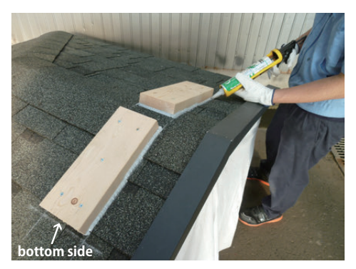
7. Caulk around the 3 sides of wood, and do not caulk the bottom side. The bottom side will let the rain go through.