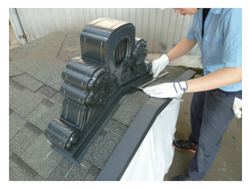
4. Outline the FB-14in so that you know where exactly it will be placed.