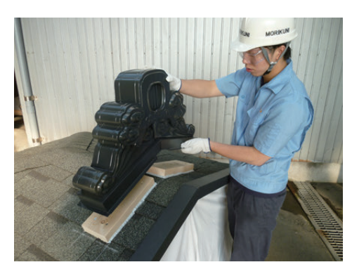
8. Cover FB-14in on those attached wood and make sure FB-14in is exactly where you drew the lines.