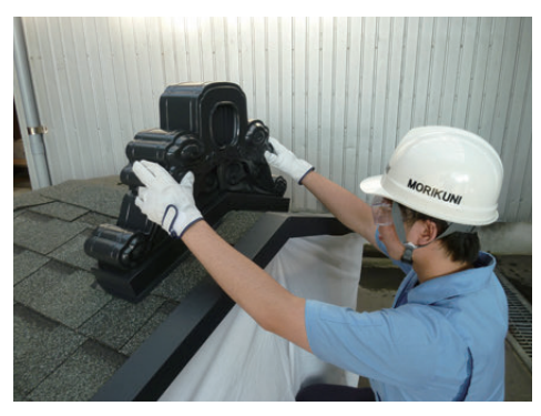
3. Find a place on the roof where FB-14in can sit stable without leaning.

Ruler, Electric drill, Hammer, Caulking gun