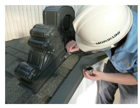
12. Use the touch-up paint that comes with B-12, and paint the head of the screws.