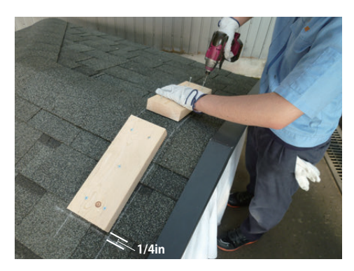
6. Attach the two pieces of wood to the roofs securely with screws. As you see on the picture, please place them about 1/4 in. above the bottom lines. This will prevent the wood from soaking rain.