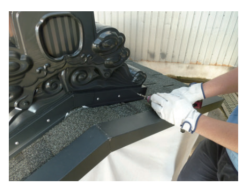
10. Screw 6 1in. screws on the front.