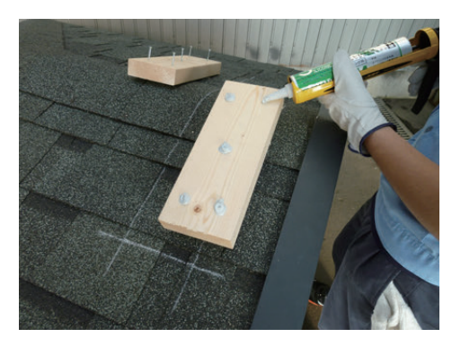
5. Drill five 3in.-screws only a half way on each pieces of wood and caulk the tip of the screws. This will prevent leaking of rain by the screw holes.