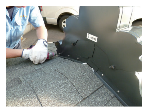
11. Screw 6 1in. screws on the back.