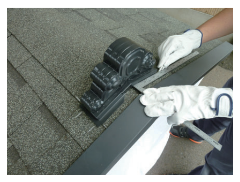
4. Outline the FB-5in so that you know where exactly it will be placed.