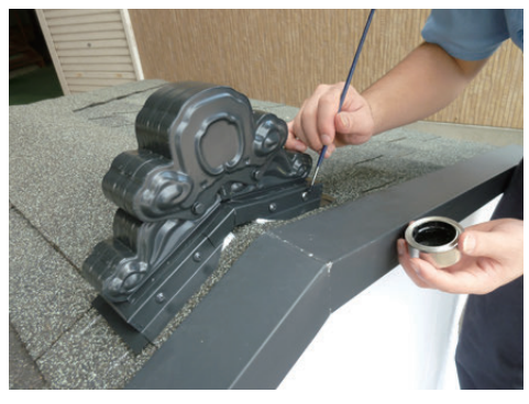
12. Use the touch-up paint that comes with B-mini, and paint the head of the screws.