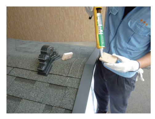
5. Drill three 2in.-screws only a half way on each pieces of wood and caulk the tip of the screws. This will prevent leaking of rain by the screw holes.