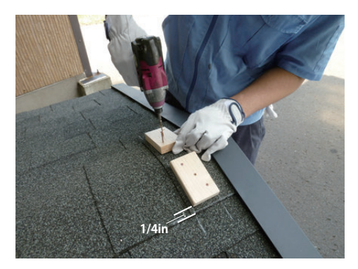
6. Attach the two pieces of wood to the roofs securely with screws. As you see on the picture, please place them about 1/4 in. above the bottom lines. This will prevent the wood from soaking rain.