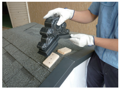
8. Cover FB-5in on those attached wood and make sure FB-5in is exactly where you drew the lines.