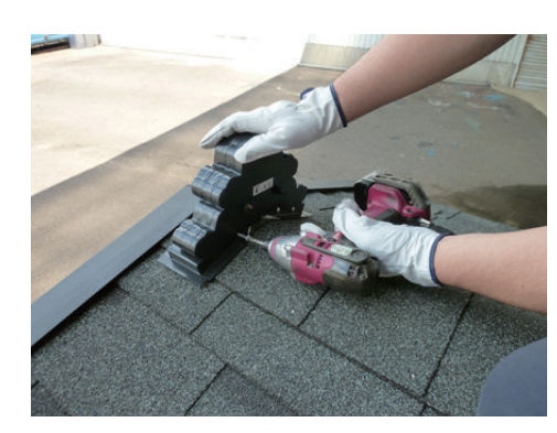
11. Screw 4 1in. screws on the back.