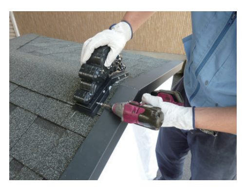
10. Screw 4 1in. screws on the front.