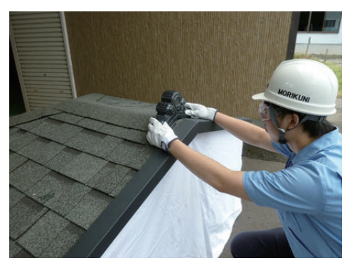
3. Find a place on the roof where FB-5in can sit stable without leaning.

Ruler, Electric drill, Hammer, Caulking gun