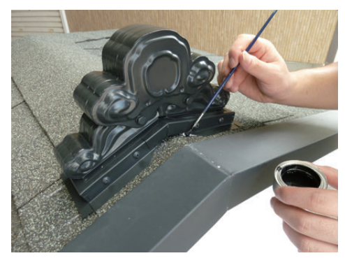
14. Paint the caulking as well.