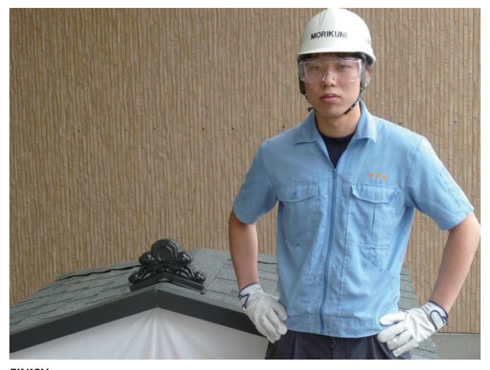
FINISH Please wear a helmet, goggles, gloves and safety belt to work safely and efficiently at high working site.