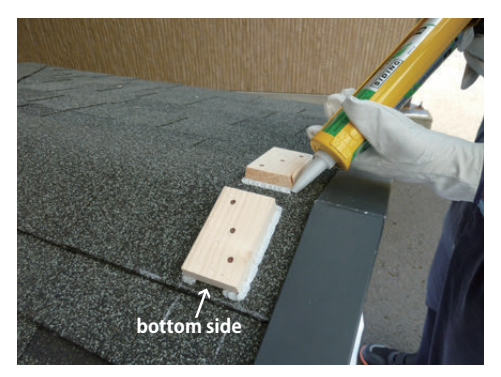
7. Caulk around the 3 sides of wood, and do not caulk the bottom side. The bottom side will let the rain go through.