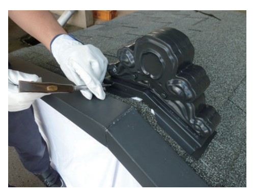
9. Make 4 guide holes on the front side and another 4 guide holes on the back side of B-mini. Those are for 1in.-screws to pierce through the wood.