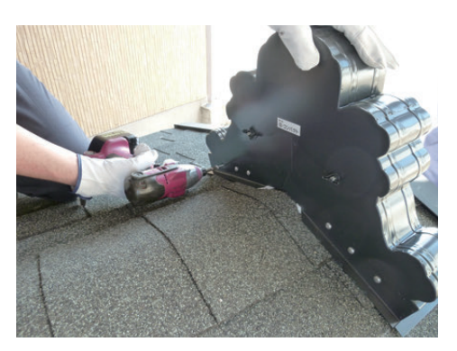
11. Screw 6 1in. screws on the back.