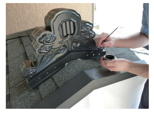
12. Use the touch-up paint that comes with B-compact, and paint the head of the screws.