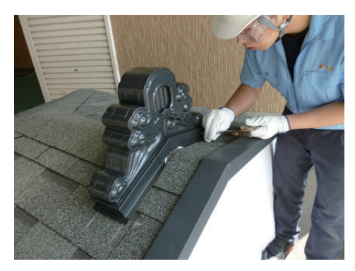
9. Make 6 guide holes on the front side and another 6 guide holes on the back side of B-compact. Those are for 1in.-screws to pierce through the wood.