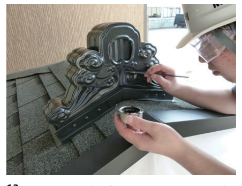
13. Paint any scratches from setting B-compact with the touch-up paint.