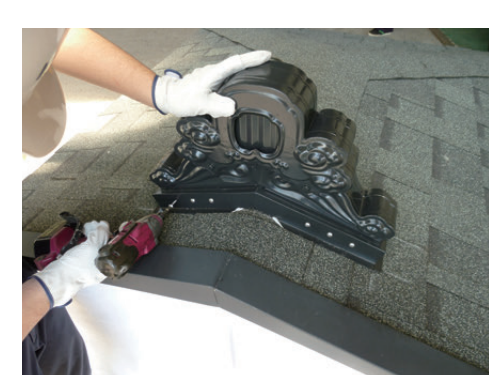
10. Screw 6 1in. screws on the front.