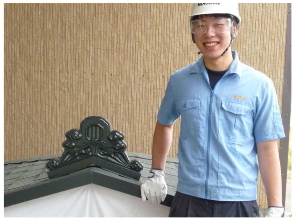
FINISH Please wear a helmet, goggles, gloves and safety belt to work safely and efficiently at high working site.