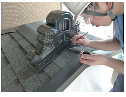
14. Paint the caulking as well.