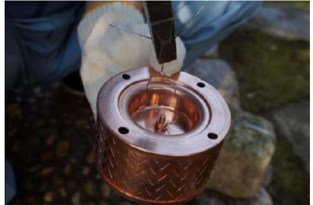
⑧ Make a ring of stainless steel wire on the back of the decorative weight.