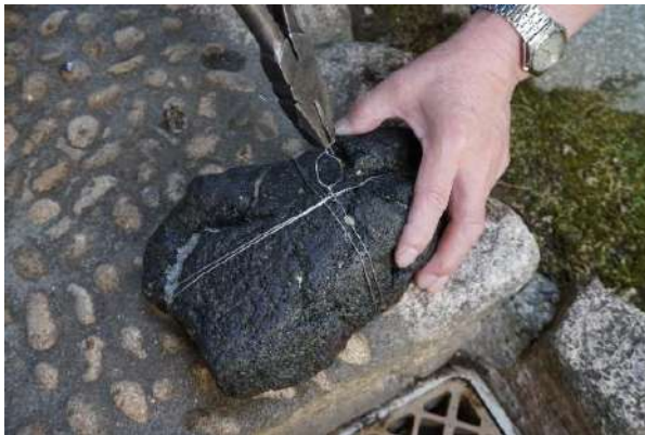
⑨ Make a ring also on a somewhat large rock that will serve as a weight.