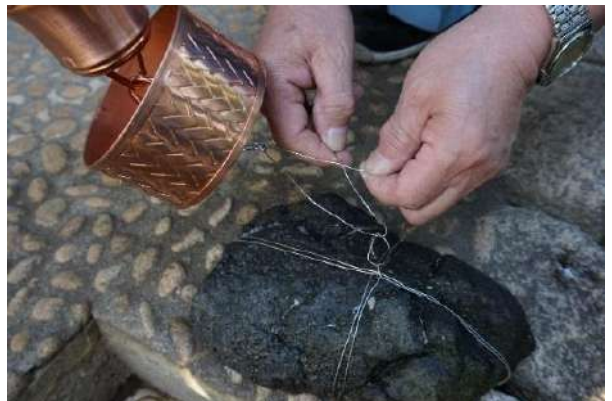
⑩ After hanging the whole chain, connect the Decorative weight and the rock while checking to make sure that it is not too tight.