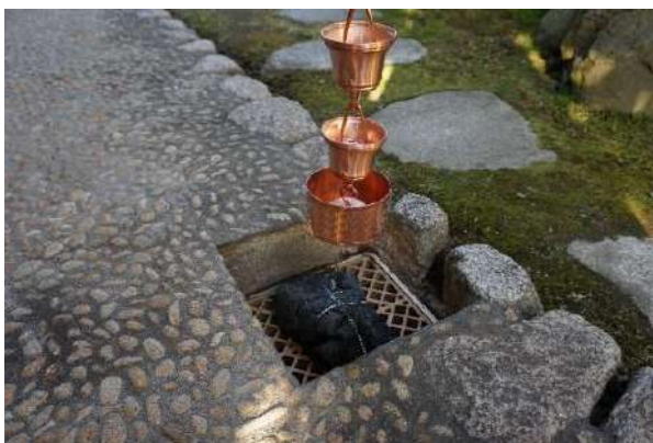
⑪ Set the rock on the drain.