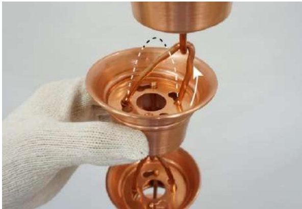
⑦ Connect all of the units. The connecting wire can fall into the holes, so lift it up to the correct place.